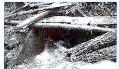
Logs and debris (shown following the Nov. 14 storm) impede water at a culvert under Marine View Drive.