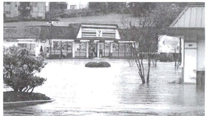
Water from Massey Creek flooded over Kent-Des Moines Road at Marine View Drive during the storm Nov. 14.