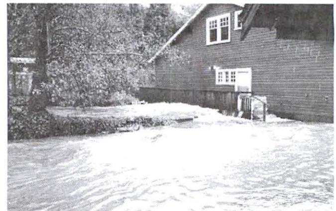
Flood waters from Des Moines Creek caused significant damage to the Des Moines Senior Center on Nov. 14, causing the main dining hall and classroom to be closed indefinitely.